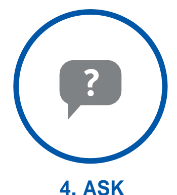
Ask everyone to give.

Connect employees to our work and show them how they can ensure a better future for their community.